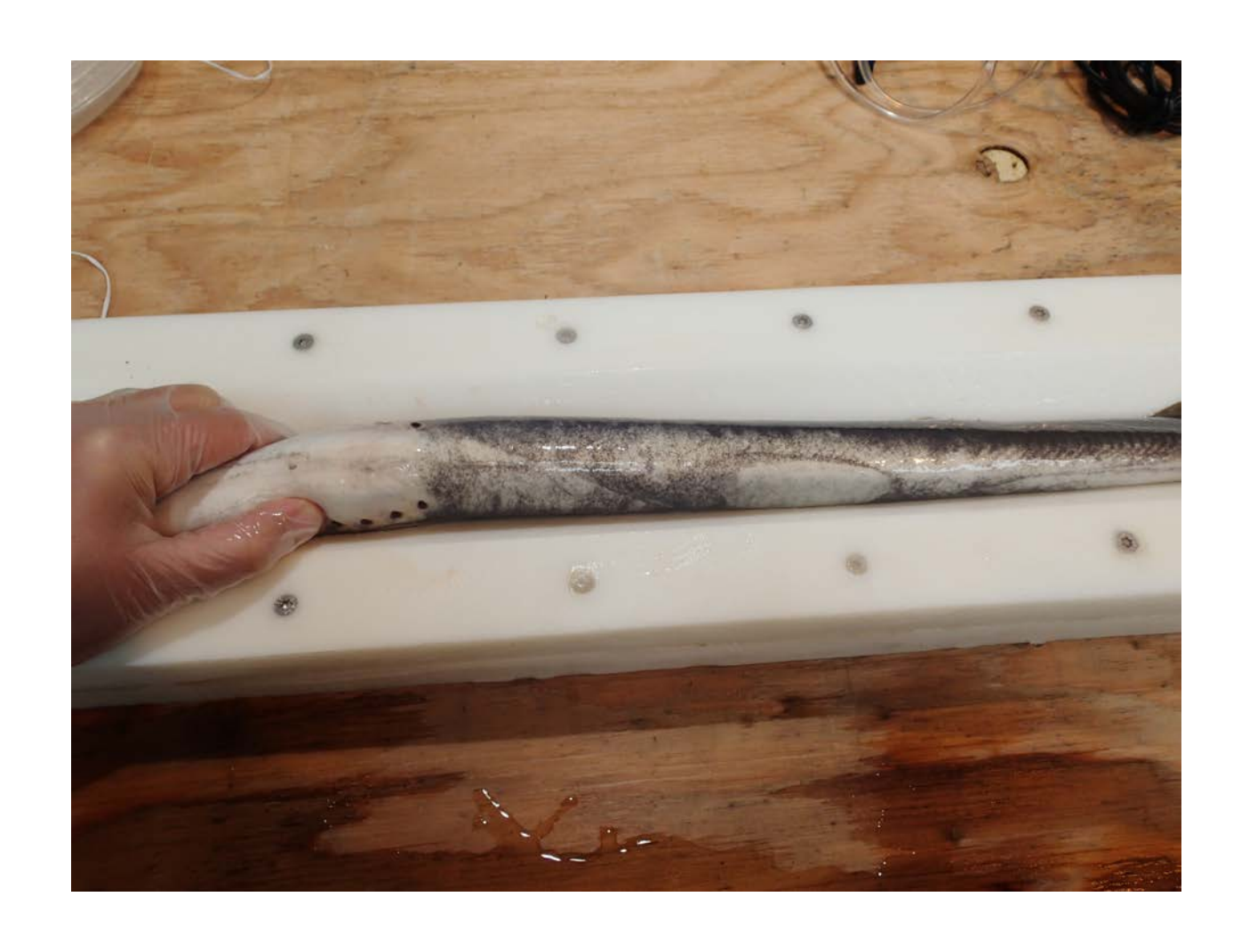
Sincerely, Project Fisheries